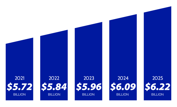
Pool Care Sector Forecast 5