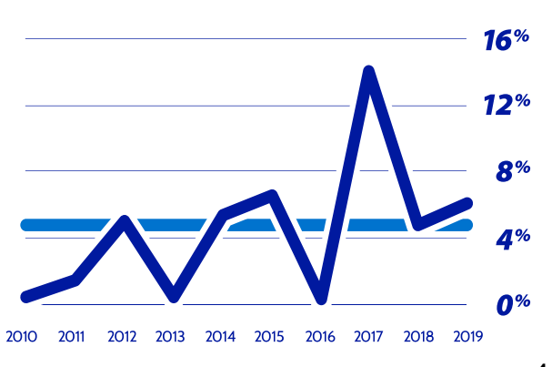
10 Year Pool Service Growth <sup>4</sup>